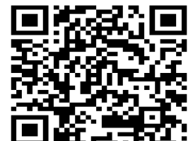
Scan for Online Giving

Online giving is an excellent way to fulfill your obligation to support St. Francis parish. Go to www.stfrancisorangetx.org and click the Online Giving link.